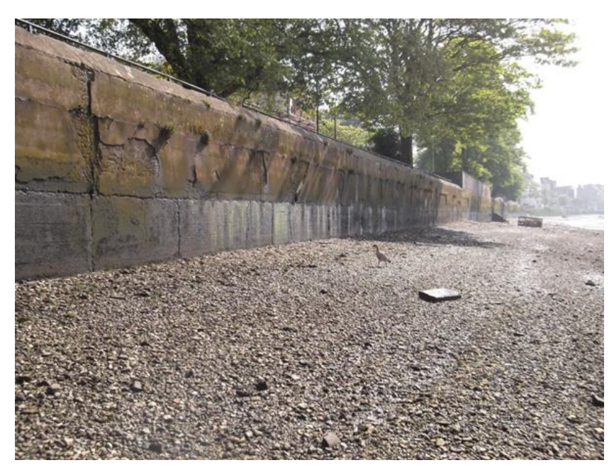
The retaining wall at Strand on the Green will be repaired over the next five months.

"At a time when regeneration is particularly important for this borough, this project fits in well with our improvement works across all of Hounslow."